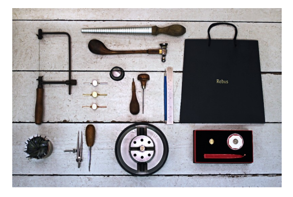
Rebus tools and handcrafted signet rings.

London Craft Week is delighted to announce that dunhill and Purdey are jointly supporting this year's event as Headline Sponsors.