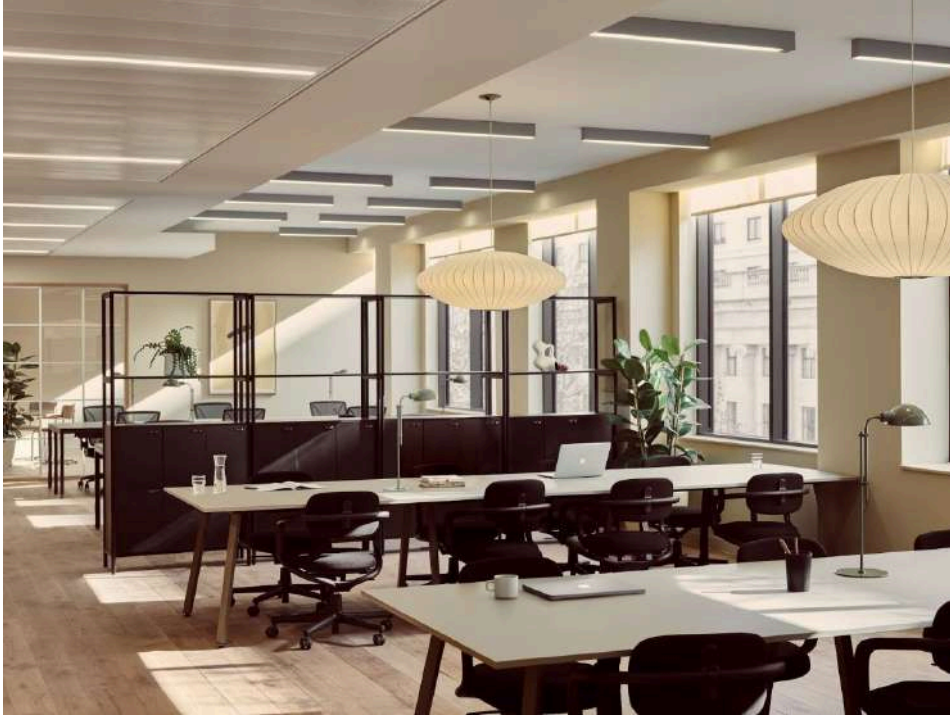
210 Euston Road interiors by Universal Design Studio.

Seamlessly weaving together the practical functionality of the workspace with the aesthetic standards associated with luxury hospitality settings, TOG and Universal have delivered a bright, richly detailed environment full of warmth and texture – from the grand and contemporary oak-clad reception all the way up to the parquet-floored, cork-ceilinged bar and event space the top floor.