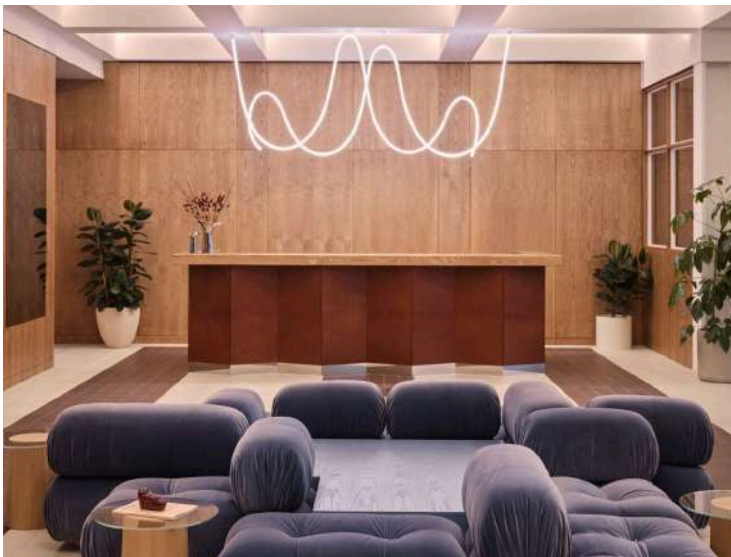
Entrance lobby of 210 Euston Road.

With design by Universal Design Studio, distinctive and flexible workspace is offered to enterprises of all sizes at 210 Euston Road