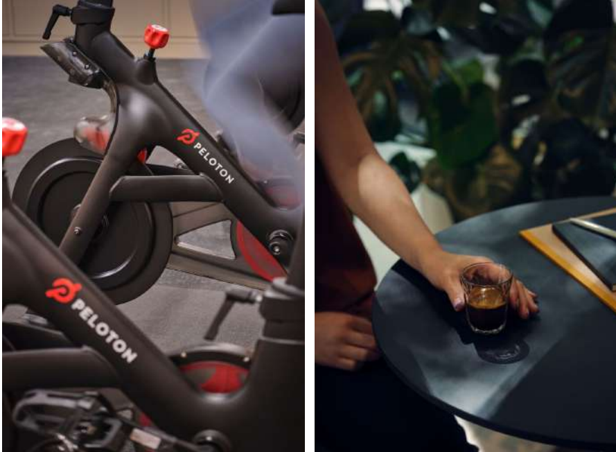
Benefits include a Peloton studio and coffee by Caravan.

One of the building's biggest benefits is an unusual abundance of outdoor space, care of 16 generous terraces high above street level, offering sweeping views over King's Cross. Access to the open air, teamed with floods of natural light and Universal's considered, human-centred design, makes 210 Euston Road a stimulating and appealing place to do one's best work.