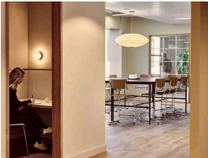
TOG's 210 Euston Road designed by Universal Design Studio.