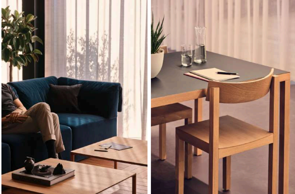
210 Euston Road features distinct zones for working, collaborating and unwinding.