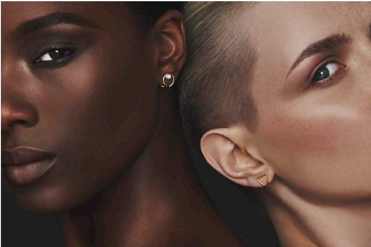
Original Silver With White Diamond and Gold Triangle

Gravity-defying earring brand celebrates its 4th birthday with new website and designs.