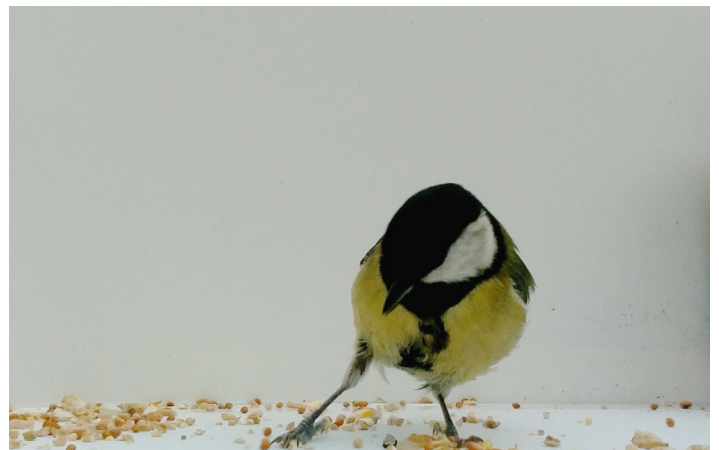
My Naturewatch images from the Interaction Research Studio at Goldsmiths, University of London