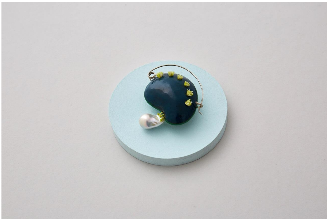
Bean & Pearl Brooch by COCO.G.

One Year In exhibitors also have an opportunity to take home a New Designers One Year In Development Award – presented on each week of the show to the designer or studio who demonstrate the highest degree of quality, originality, cohesiveness and dedication to development in their work.