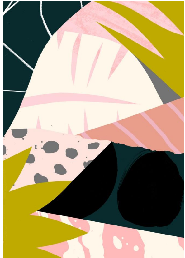
Hypnotic (left) and Plant Dust (right) by Tom Abbiss Smith.

→ Black and white stoneware from self-taught ceramicist Bronwen Grieves , who has been making and firing work in her Nottingham garden studio for more than 30 years, but never shown it publicly until now. Inspired by mid-century design and a love of gardening, Grieves' vessels are made using flat coils of grogged stoneware incised with lines and fixed together, with minimal glazing and partially rubbed surfaces to expose colour and texture.