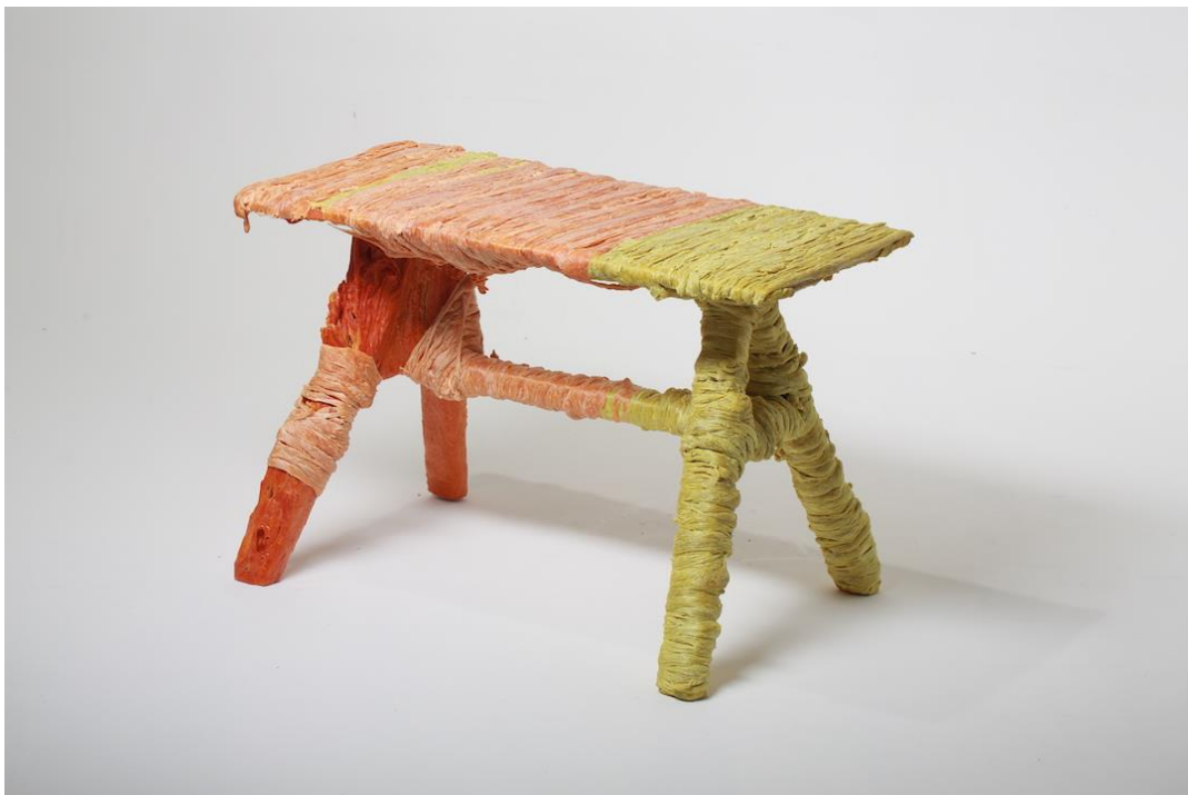
Polystyrene table by Sam Lander.

One Year In gives visitors a face-to-face introduction to the materials, processes, products and people building the design world of tomorrow. Many are blending disciplines, media and techniques to create functional and inspiring creative visions – such as the textile/jewellery fusions of Thread Studio , who exploit the contrast between the materiality of traditional silversmithing with the fluidity of fabric; and the stationery products of Arturo Soto Flores , made with reclaimed marble.