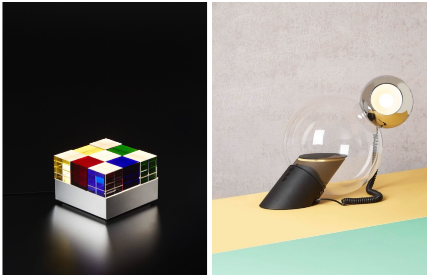
Left to right: MSCL1 Cubelight by Tecnolumen, Gravita Floor Lamp by Antonio Macchi Cassia for Stilnovo.

The recent revival of Italy's legendary modernist design house Stilnovo has led to the return of iconic 20th-century lighting designs, many in limited-edition bespoke production run exclusively available at The Conran Shop. These include Joe Colombo's articulated Topo Floor Lamps – now recreated from the designer's original 1970 sketches; an exclusive issue of Antonio Macchi Cassia's Gravita Floor Lamp (previously only ever a prototype); and a pair of 1970s designs from De Pas, D'Urbino, Lomazzi – the Fante Desk Lamp and the helmet-like Lampiatta series of table, desk and wall lamps.