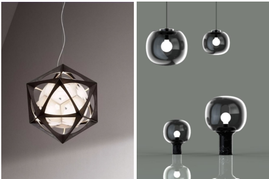
Left to right: OE Quasi Pendant by Louis Poulsen, Flo Series by Samuel Wilkinson.

Samuel Wilkinson's Flo Lights form the first lamp collection to be designed and manufactured exclusively for The Conran Shop. Each showcases a rounded mouth-blown shade in Czech glass that delicately floats and envelops a slim marble base, creating an almost seamless connection between the two texturally contrasting materials. This season, Wilkinson and The Conran Shop have supplemented the existing Flo Table Light with a smaller version and a set of pendants in two sizes – creating a family of lights in which every member can stand alone or operate in harmony with its siblings. The glass shades are available in three colours: bronzed amber, frosted opal and deep smoke.