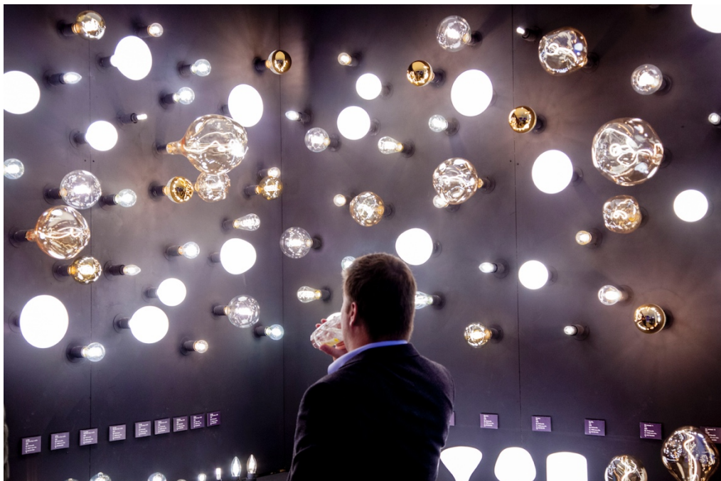
Dark is the Night 2018, The Conran Shop Chelsea.

The coming of winter shortens our days, the clocks go back, and the lighting design of our homes takes centre-stage once more. As the year comes to a close and the sunlight grows weaker, the way we choose to illuminate our environment is a matter of more than aesthetics; light shapes our emotional landscape as much as the look and feel of our home interiors. In the darkness of winter, light matters most.