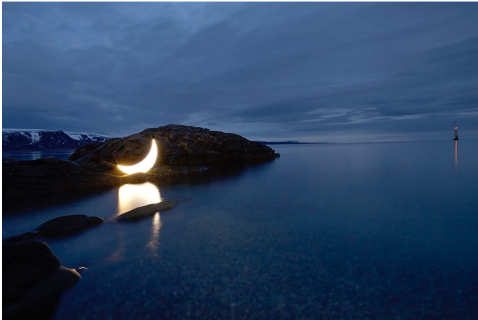
Private Moon by Leonid Tishkov, photography by Leonid Tishkov.

Harbour Promenade, Oslo 1–3 November 2019