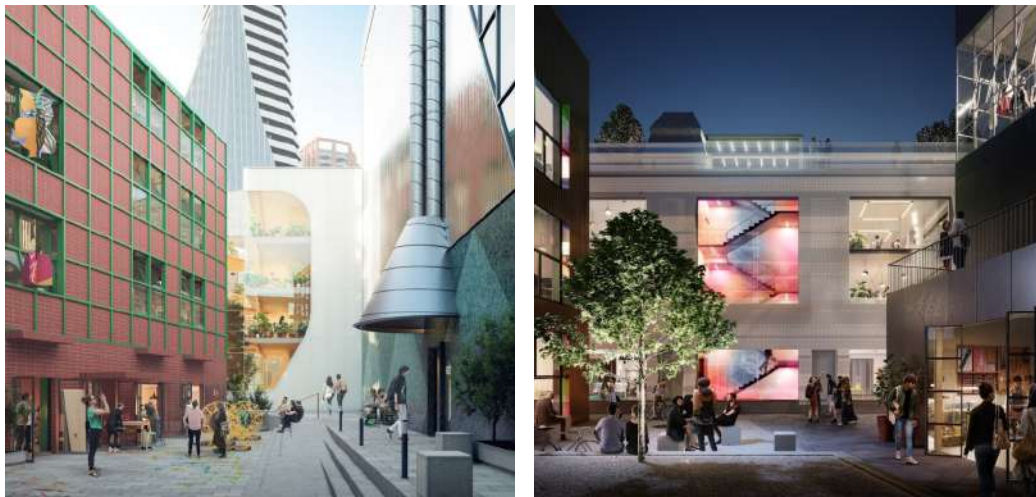
Spaces for meeting and working with neighbours in shared courtyards designed for all types of making and social gatherings.