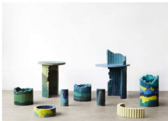
(Left) Marble-effect coasters made from waste plastics sourced from Brighton & Hove. (Right) Polyurethane foam dust objects by Charlotte Kidger.

All four designers and their reimagined-plastic products will be on display in Hall 13 on the second floor of the Old Truman Brewery from 20–23 September 2018 .