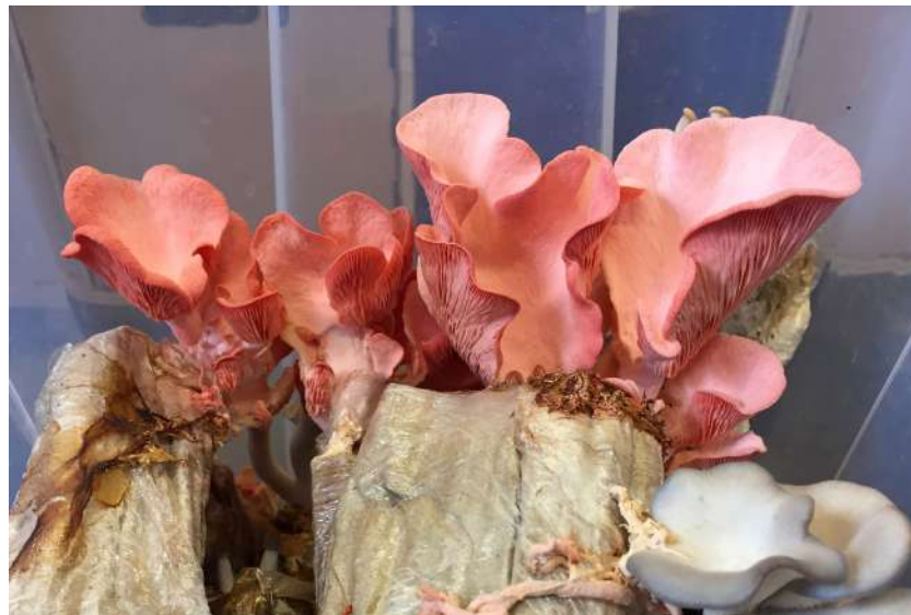
Pink Oyster mushrooms MITIGATION OF SHOCK, SINGAPORE, Superflux