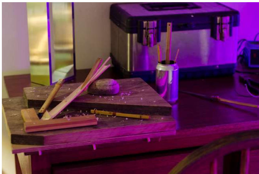
Workbench: creating tools, traps, and snares MITIGATION OF SHOCK, SINGAPORE, Superflux