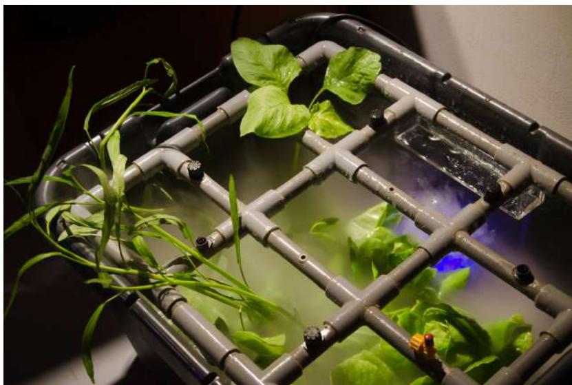
Vegetables thriving in an indoor food growing system MITIGATION OF SHOCK, SINGAPORE, Superflux