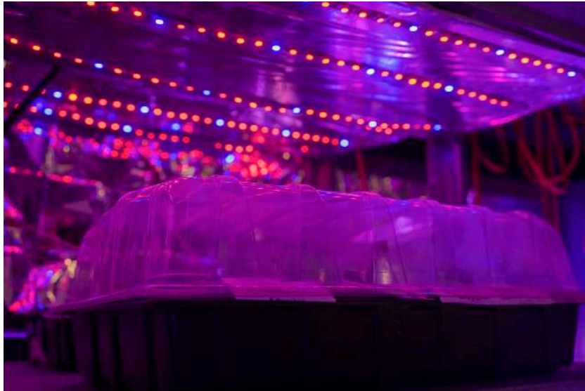
Mealworm habitat in food growing system MITIGATION OF SHOCK, SINGAPORE, Superflux