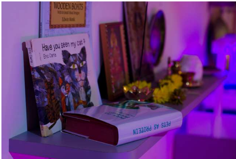
Cook books – 'Pets as Protein' and 'How to Cook in a Time of Scarcity' MITIGATION OF SHOCK, SINGAPORE, Superflux