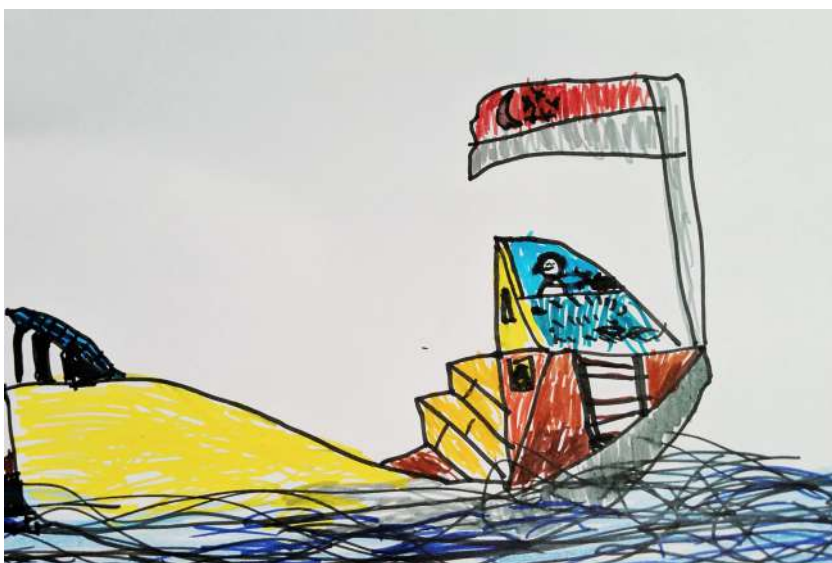
Child's drawing of everyday life in a flooded city MITIGATION OF SHOCK, SINGAPORE, Superflux