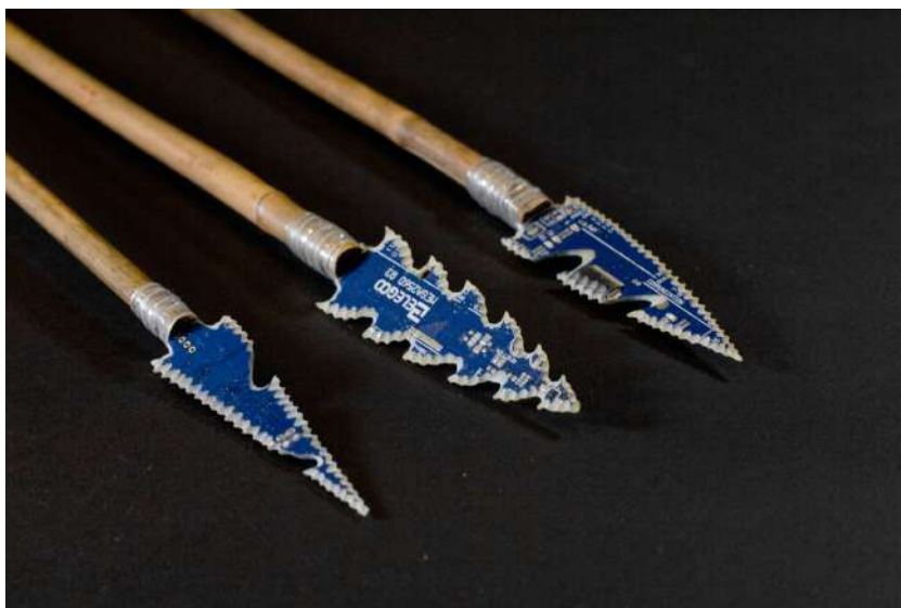
Spears made from discarded circuit boards MITIGATION OF SHOCK, SINGAPORE, Superflux