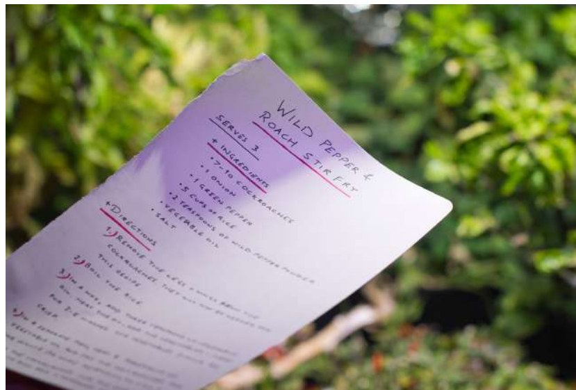
Recipe for Roach & Pepper stirfry MITIGATION OF SHOCK, SINGAPORE, Superflux