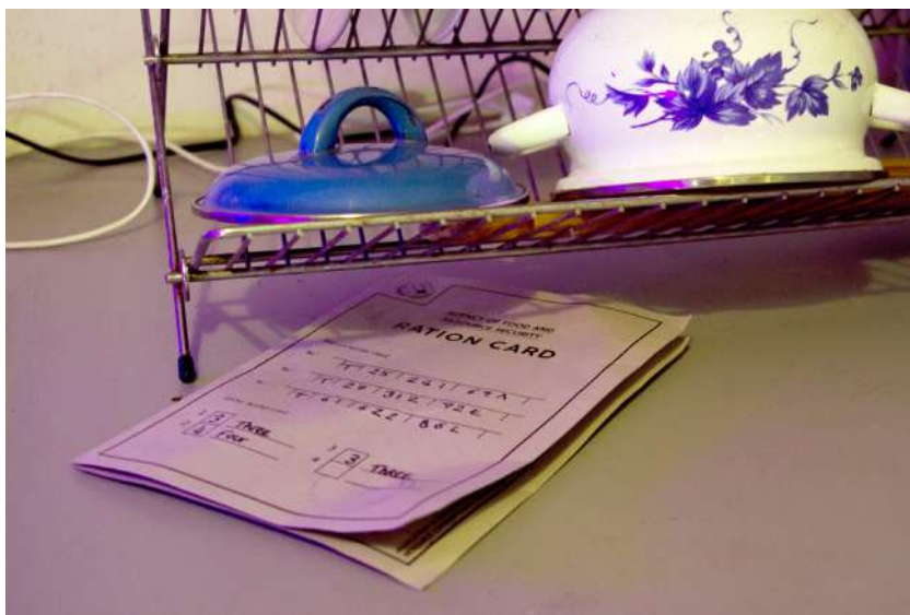
A ration card sits in the kitchen MITIGATION OF SHOCK, SINGAPORE, Superflux