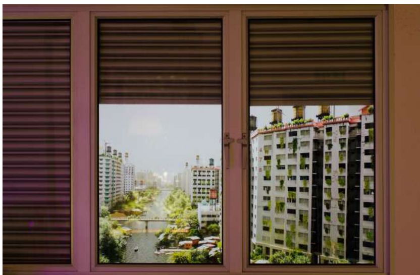
View from the apartment of a flooded Singapore MITIGATION OF SHOCK, SINGAPORE, Superflux