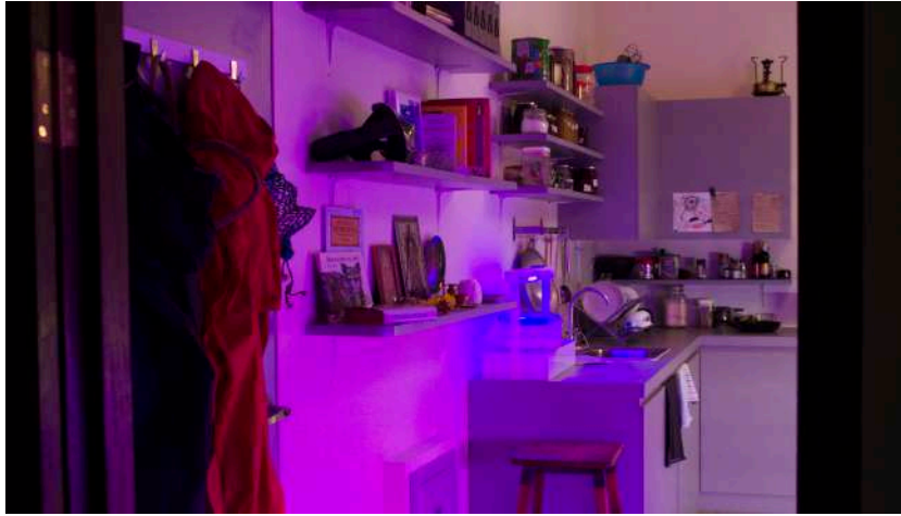
Entering the apartment MITIGATION OF SHOCK, SINGAPORE, Superflux