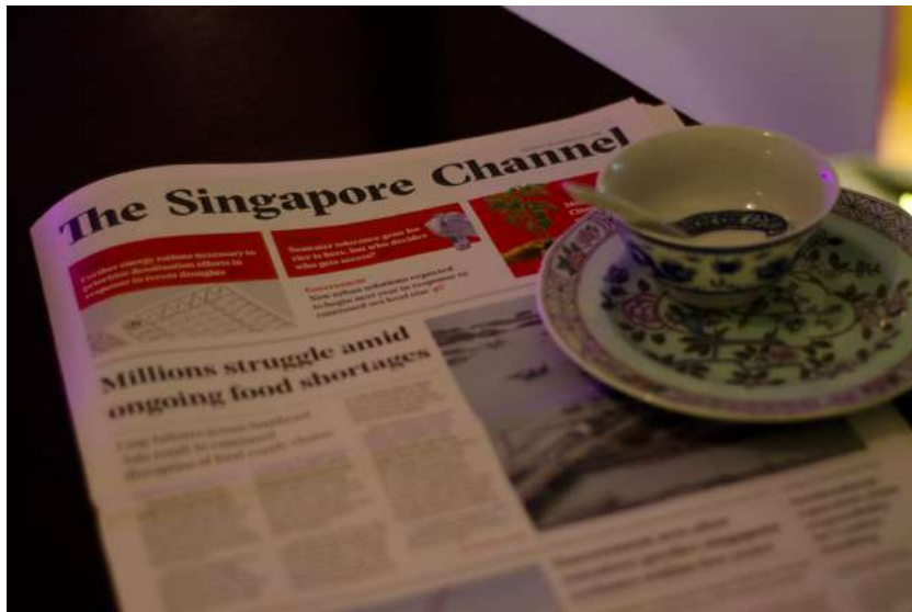
Newspaper from the future: Millions struggle amid ongoing food shortages MITIGATION OF SHOCK, SINGAPORE, Superflux