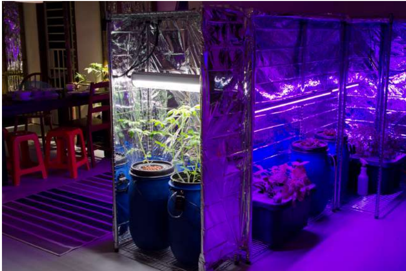
Vegetables thriving in an indoor food growing system MITIGATION OF SHOCK, SINGAPORE, Superflux