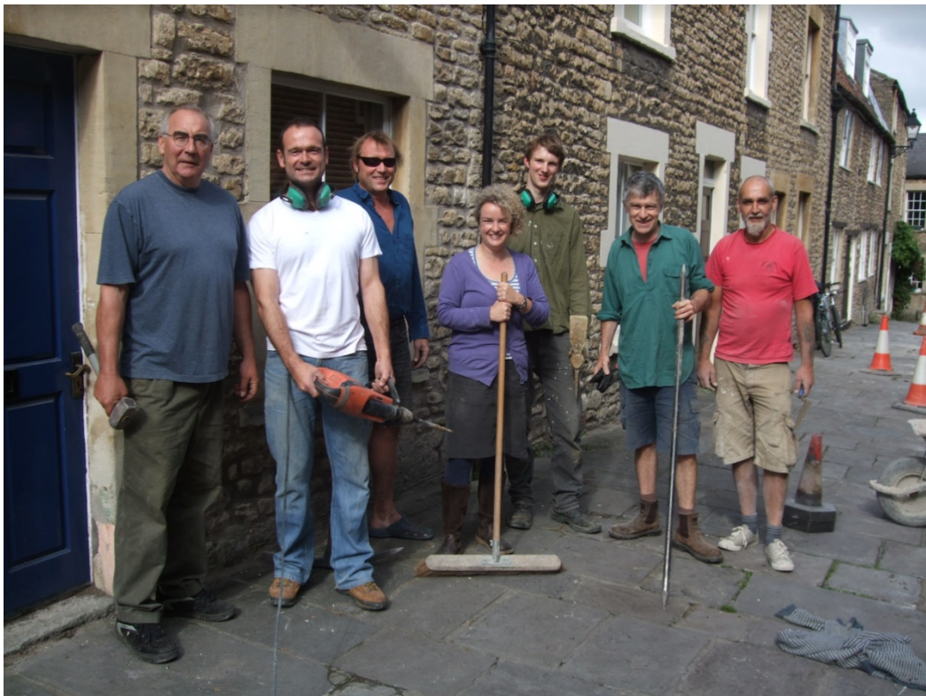
Councillors in Frome taking matters into their own hands and fixing broken paving.

The Flatpack Democracy movement started in Frome, Somerset, in 2011 when a group of residents, frustrated with political squabbling and vested interests, launched a successful campaign to take over their local council. For the last decade, Independents for Frome has successfully run the town council exclusively for the benefit of the local community, launching and delivering a string of initiatives aimed at accelerating the social, ecological and political regeneration of the local area. In 2015, Frome was named Council of the Year.