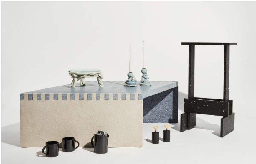
Ready Made Go 3 collection.

In collaboration with Ace Hotel London Shoreditch , Ready Made Go enters its fourth year as the London Design Festival exhibition with no end date. Curated by Laura Houseley of Modern Design Review , Ready Made Go features functional pieces commissioned for Ace Hotel from emerging and established London-based designers. In concert with the obvious needs of a hotel — door knobs, coat hooks, tables, ashtrays, etc — Ace Hotel and Houseley routinely ask how experimental and innovative design can change how the public interacts with a space (like the design of a permanent bouldering wall in Ace Hotel London, for example).