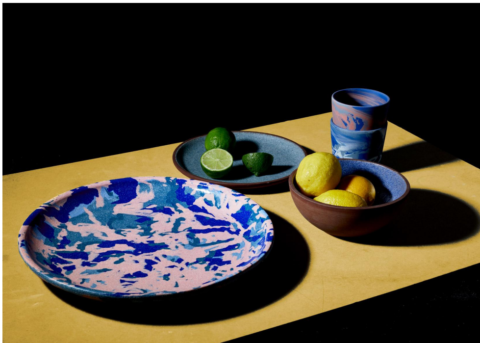
Ceramics by Granby Workshop.