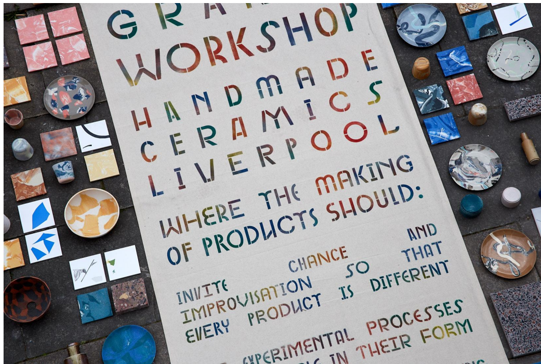
Ceramics by Granby Workshop.

Travelling down from Liverpool to join Lower Stable Street's line up of designers for one weekend only is Granby Workshop – the ceramics studio set up by Turner Prize-winning architects Assemble.