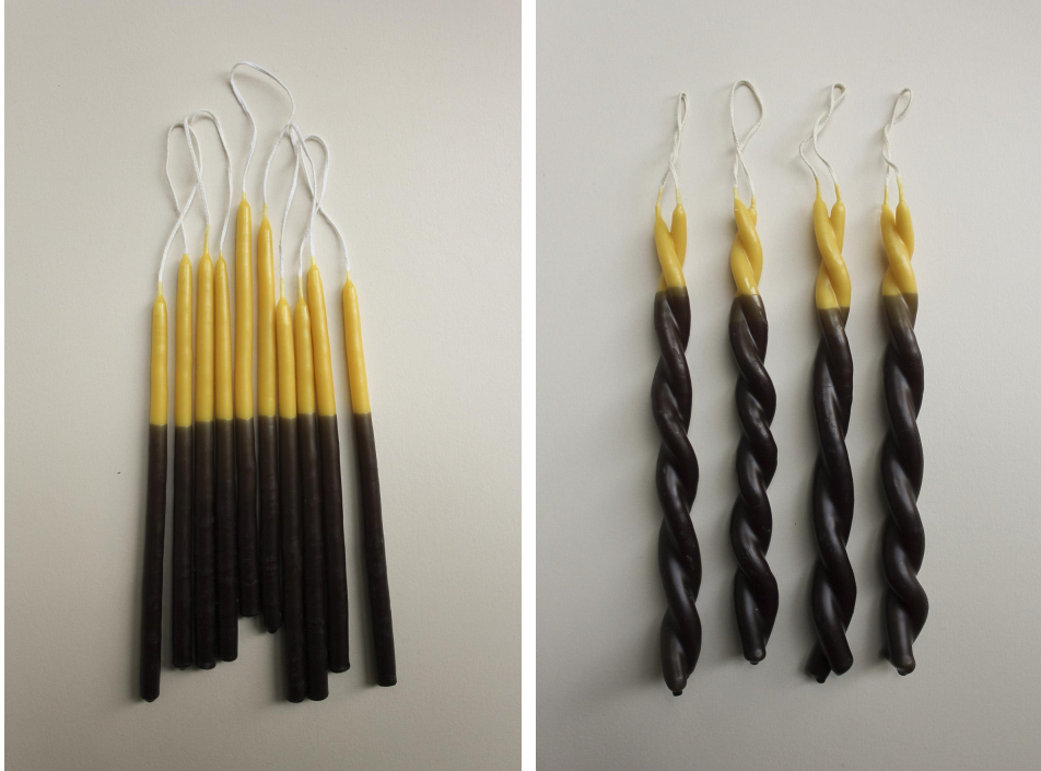
Candles by Wax Atelier.

Other champions of heritage craft include STORE Projects associate Wax Atelier who is revitalising the traditional beeswax craft techniques. Wax Atelier's hand-dipped beeswax candles are available to buy at the STORE STORE winter market and year round in STORE STORE.