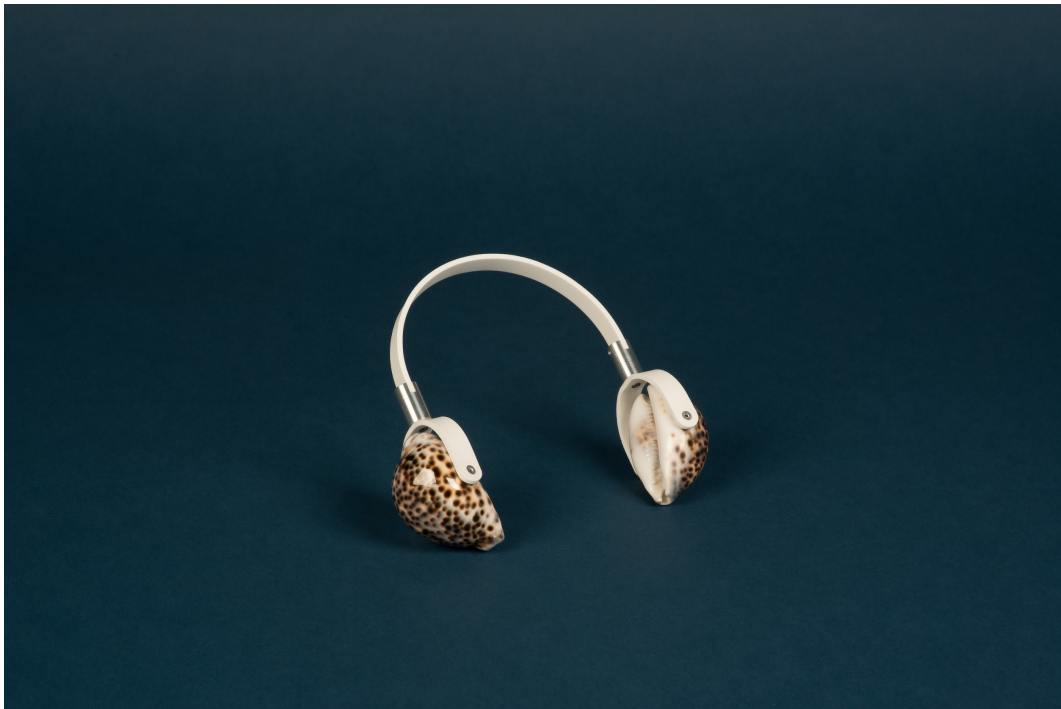
Seashell headphone by Unit Lab.

To reduce the post-Christmas glut of waste paper, Kiosk N1C will also be operating a free, on-demand wrapping-paper making service, courtesy of the risograph printer provided by Hato Press . Rather than generating waste with plastic-wrapped rolls, visitors buying gifts on Lower Stable Street will be able to have their purchases wrapped in FSC-certified, recycled papers, printed while they wait with an exclusive design created for Lower Stable Street by IYA Studio .