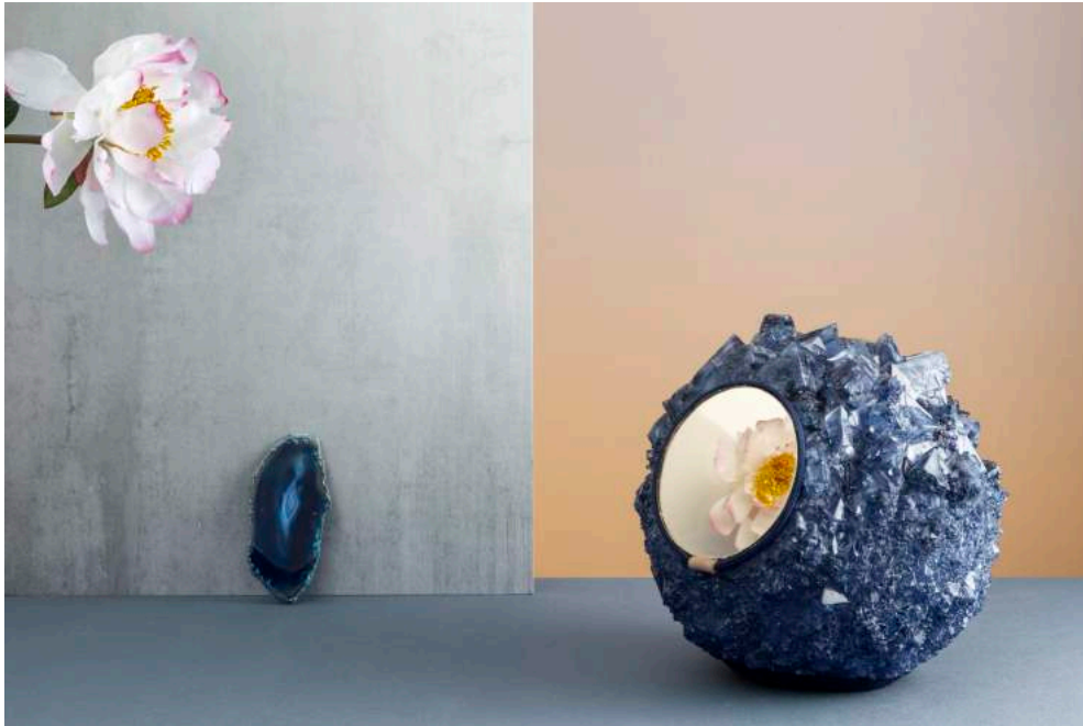
Crystal Mirror by Isaac Monté for Form & Seek

This September is the first time that Dutch design will have a dedicated presence at London Design Fair, as over 65 studios, collectives, labels and independent makers from the Netherlands come together for an unprecedented national showcase.