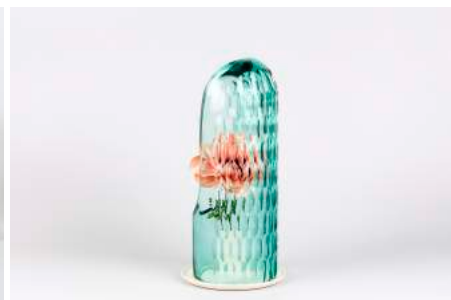
(Left) Bottles by Klaas Kuiken Design, (Middle) Align by Vij5, (Right) OP Vase by Form & Seek