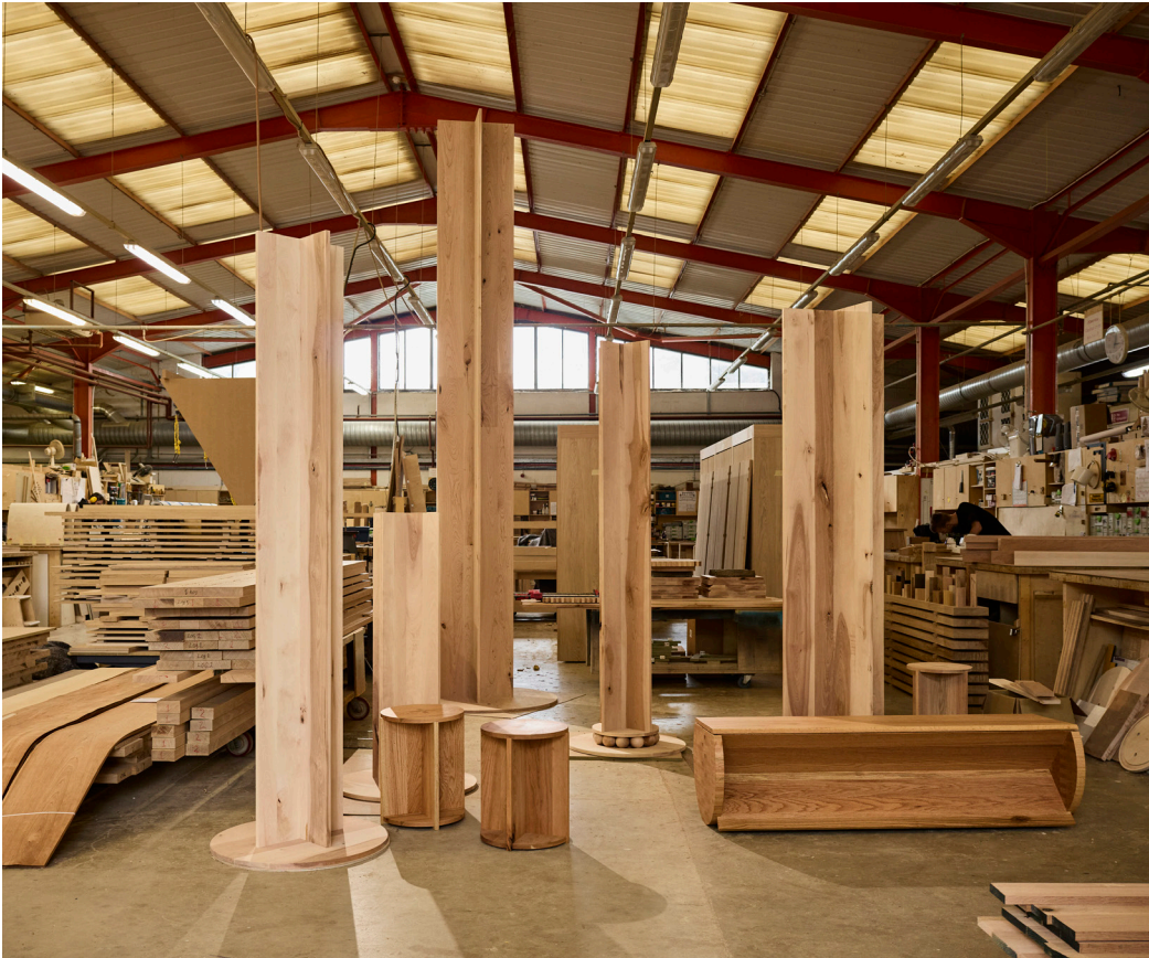
The making of the Wood for the Trees exhibition.

The exhibition takes the visitor through five stages in the story of timber: