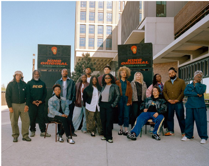
The Music is Black Festival curators and choreographers.

A major new addition to London's international cultural calendar for 2026, The Music is Black Festival from East Bank at Queen Elizabeth Olympic Park encompasses an eight-month season of events celebrating Black British music.