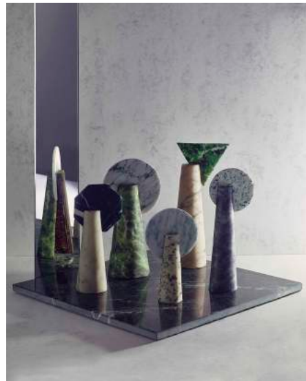
'KUF Cakes' from Kia Utzon Frank