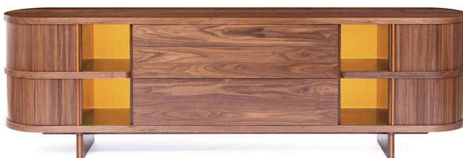
Gaiola Credenza side board | Tree Couture

Exhibition open >> 10am–8pm each day, 24 th -26 th May