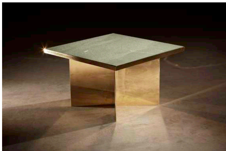
Green & Brass table, Novocastrian