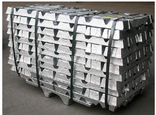
Aluminium Ingot