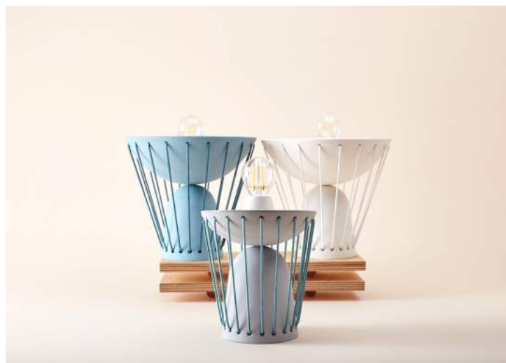
Elastic Lights , Marta Bordes