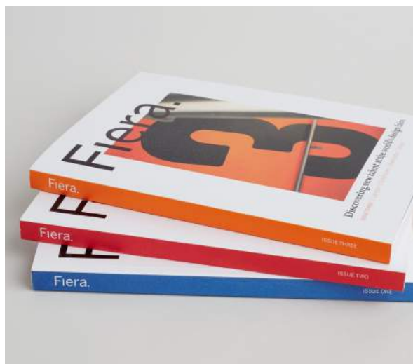
Fiera magazine , edited by Katie Treggiden

Exhibition open >> 10am–8pm each day, 24 th –26 th May