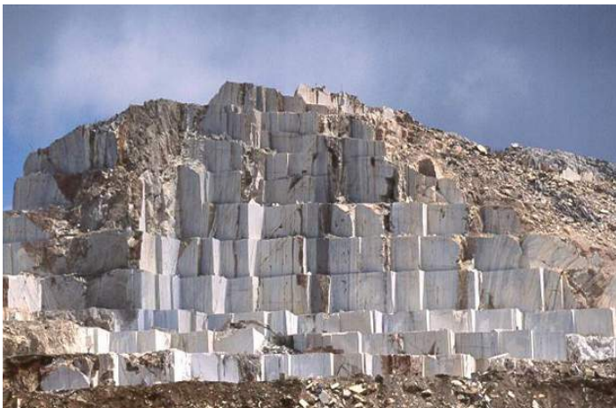
Marble Quarry

Exhibition open >> 10am–8pm each day, 24 th -26 th May