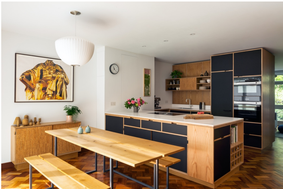
Dartmouth Road by Uncommon Projects.