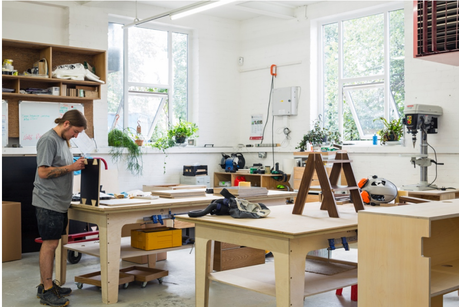
Uncommon Projects' workshop in North East London.

Uncommon Projects, with its use of plywood and minimalist but rich design language, proved the ideal choice of designer.