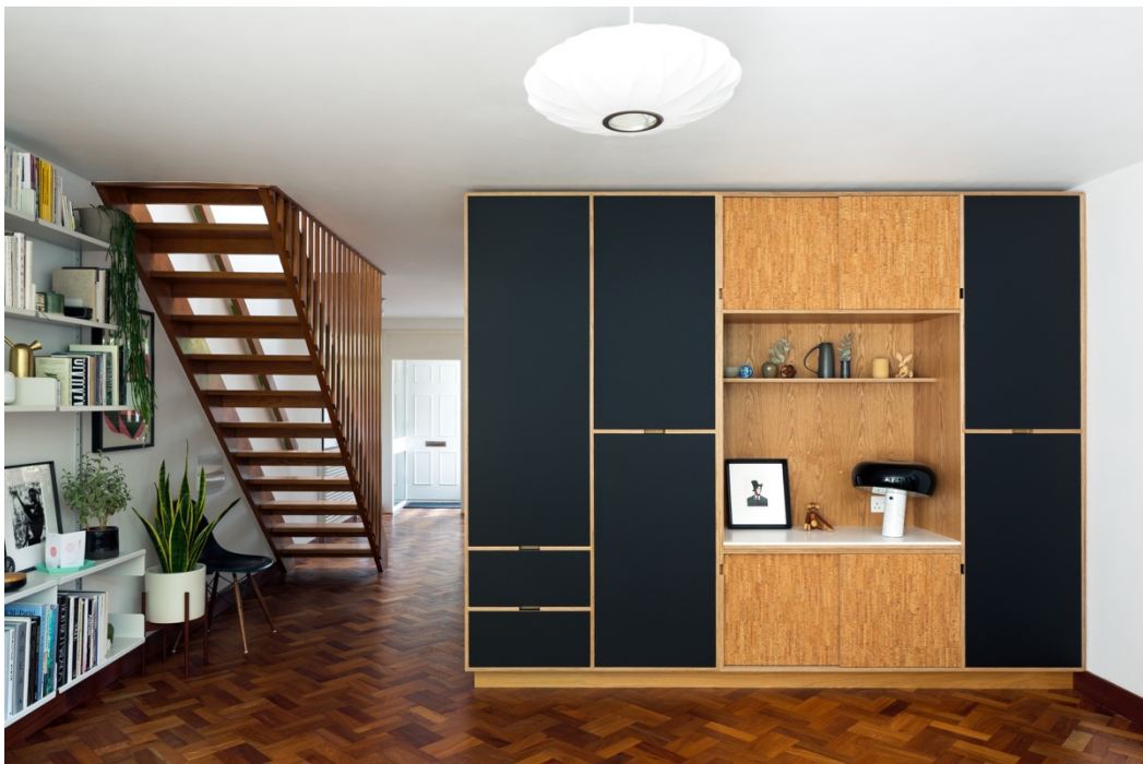
Dartmouth Road by Uncommon Projects.