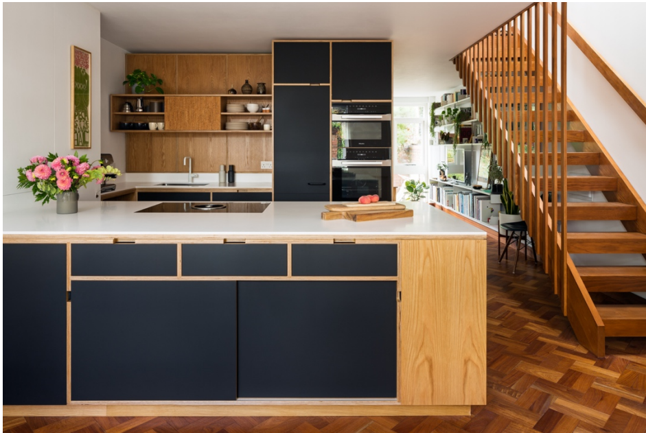
Dartmouth Road by Uncommon Projects.

Determined to bring the soul back into a neglected 1960s house, bespoke kitchen specialist Uncommon Projects introduced a novel layout that broke the space up into distinct zones and installed a luxe-feel oak-veneer kitchen – bang in the middle.