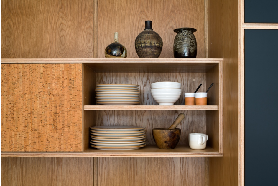
Dartmouth Road by Uncommon Projects.

clients to establish the optimum location for the kitchen area – not at the front of the house as the owners had initially assumed, but in the centre of the ground floor. This unconventional layout allowed them to fulfil the brief by creating the largest kitchen possible, introducing floor-to-ceiling storage to the living room, and also opening up the space around the front door to make for a more welcoming entrance.