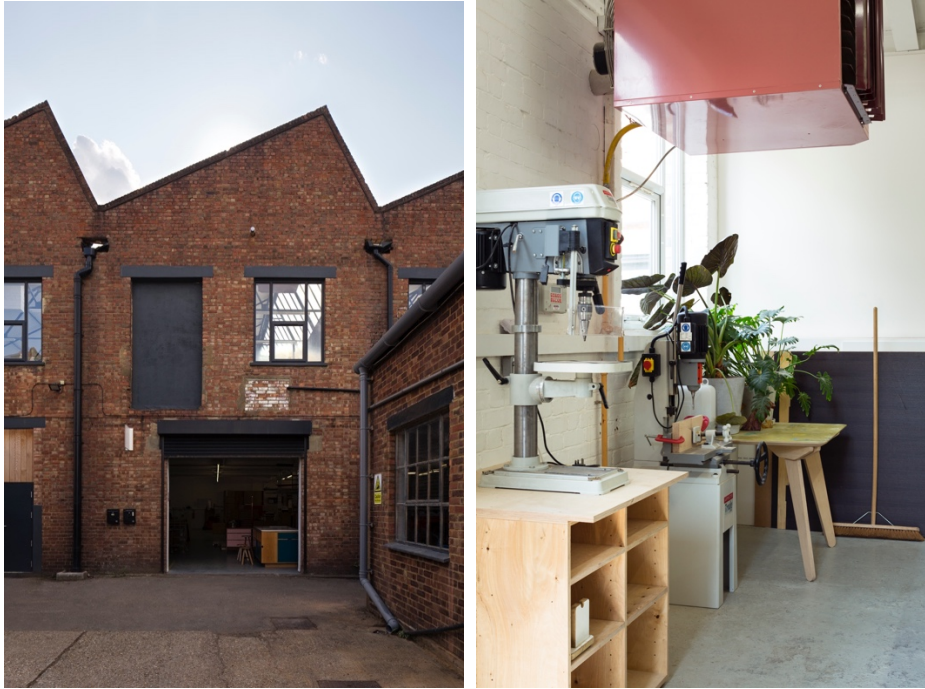
Uncommon Projects' workshop in North East London.