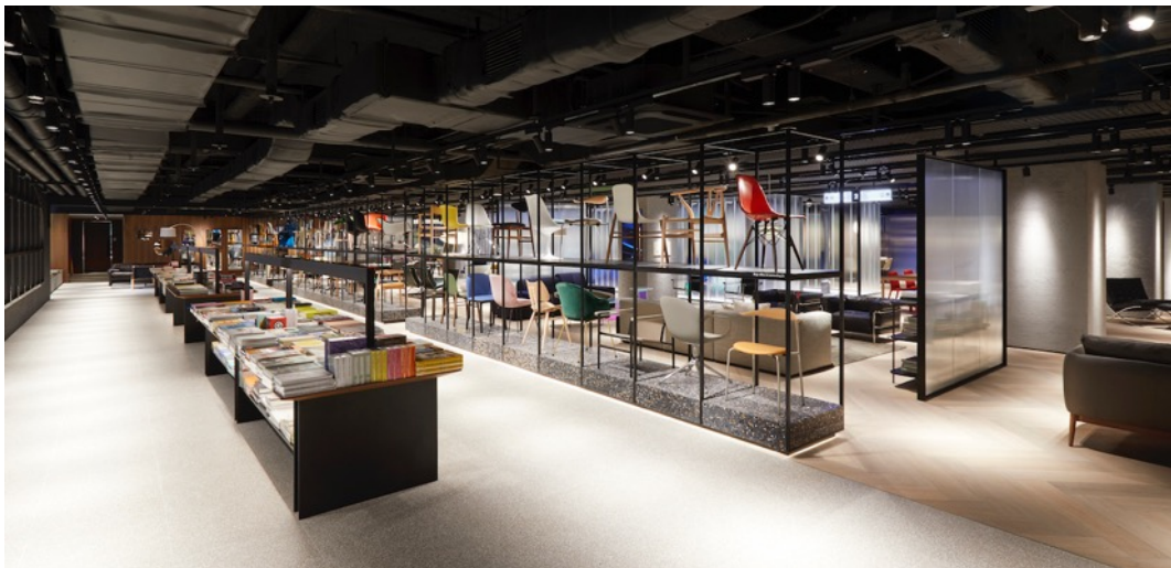
First floor view of The Conran Shop in South Korea.

Designed jointly by the creative team at The Conran Shop in partnership with architecture and interior design studio, Conran & Partners, the first floor houses an unrivalled collection of lifestyle products, with a white, bright and minimal laboratory-like aesthetic. Reached by an enclosed escalator dressed in Conran’s signature ultramarine blue, the darker and more richly textured second floor is devoted to furniture, lighting and textile products – as well as The Conran Shop’s library. The contrast between the two floors will create a yin and yang-like balance of different but complementary retail environments, appealing both to Seoul’s affluent and discerning audience of global design aficionados and the city’s growing demographic of dynamic young creatives.