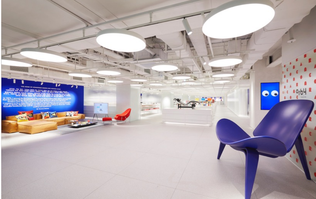
Ground floor view of The Conran Shop in South Korea.

“Opening our new store in Seoul is a pivotal moment for The Conran Shop and one of the most exciting developments in our history. It is the largest store we have ever created and it really gets the pulse racing to be opening in one of the most vibrant, modern cities in the world. We are proud to be partnering with Lotte to realise this dream and I know The Conran Shop and our design philosophy will be nurtured with care and passion. There is a natural synergy between us and a shared vision of how beautiful, modern design can lift the spirits and improve the way people live and enjoy their lives. We both appreciate organic simplicity, beauty and function, all underpinned by a playful spontaneity that adds the elusive magic ingredient.”