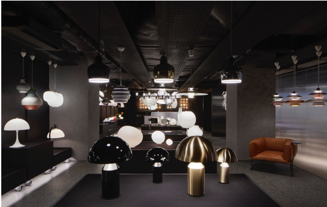
Installation view of The Conran Shop's product collection in South Korea.

The Conran Shop in Korea will sustain the brand's reputation for representing the most influential designers of the past two centuries, from Alvar Aalto to Eero Saarinen, alongside future collectibles sourced from around the world – and including The Conran Shop's own creations and collaborations. In Seoul, visitors to the new store will be met by Conran exclusives by the likes of Knoll and Carl Hansen, as well as a giant Hans Wegner CH07 Shell Chair from Carl Hansen.