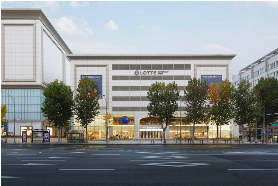
The Conran Shop’s newly opened store in South Korea.

The Conran Shop in Seoul opened on Tuesday 14 November at Lotte Department Store. South Korea, Seoul, 1F Lotte, Gangnam-gu, Dogok-ro, 401.