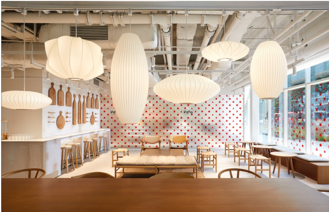
Installation view of The Conran Shop’s product collection in South Korea.

The Conran Shop’s global outlook translates from the store’s design to the products on its shelves. Responding to The Conran Shop’s pronounced affinity with the world of contemporary Korean design, with its emphasis on natural order and continuity and its reverence for fine craftsmanship, the initial product range will be a distinctly international edit. There is a focus on material and texture in the furniture collections; an emphasis on wood and ceramics in kitchen and dining; a wide range of highly textural throws and embroidered cushions in the store’s textile offering; and a strong selection of local bath and beauty suppliers.