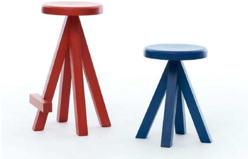
Shift by Hallgeir Homstvedt.