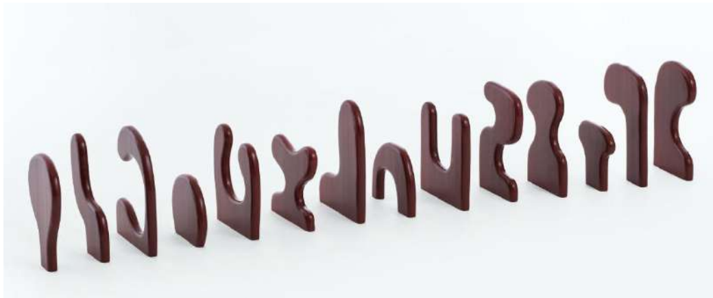
Polyp (1–14) by Henrik Ødegaard. Photography by Signe Luksengard.