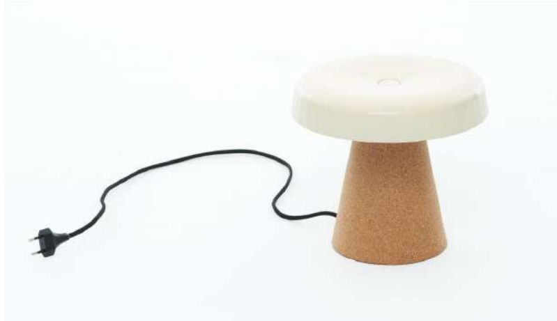
Python by Edvin Klasson.