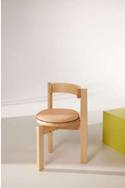
Sverre Fehn chair in lacquered pine. Design by Sverre Fehn in 1964, for Fjordfiesta.