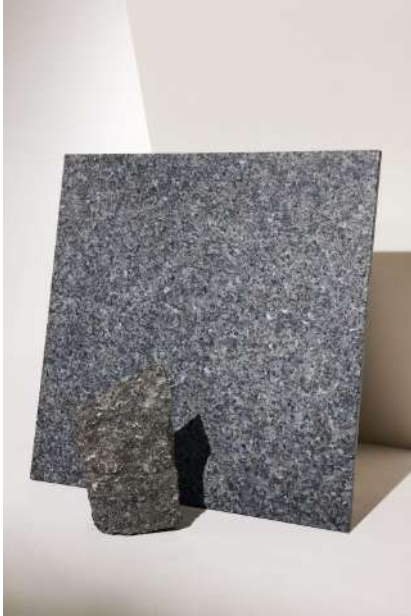
Raw and polished stone, Larvikite, by Lundhs.