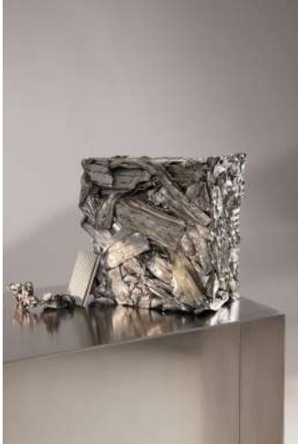
Crushed and extruded aluminium by Hydro. Photography by Sara Angelica Spilling, styling by Kråkvik & D'Orazio.