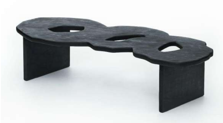
Brent by Poppy Lawman.