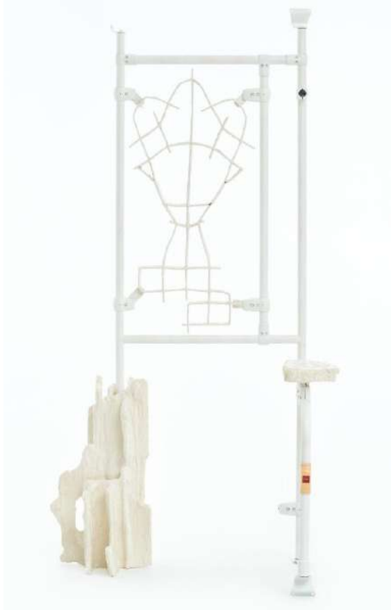
Collective Division by Nebil Zaman.