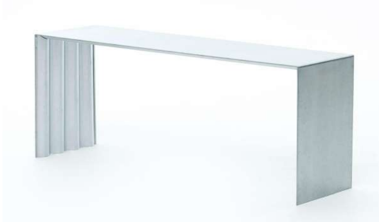
Sinus 18 by Brave New Lines.