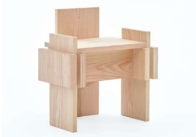
Offcut Chair 01 by Pettersen & Hein.