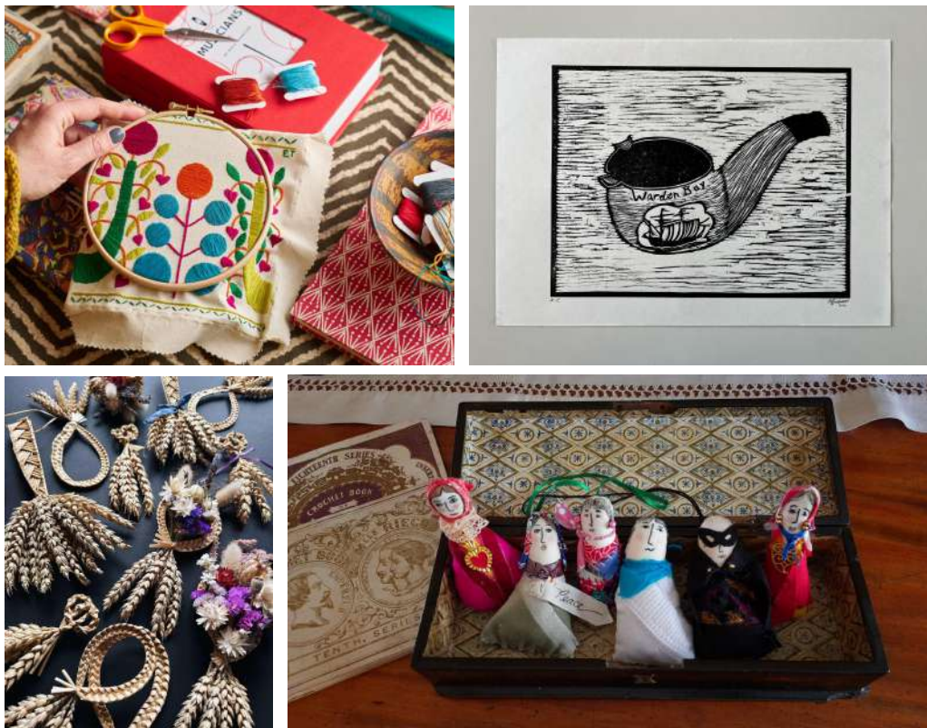
Folk craft activities (L to R): Jabberwocky embroidery with The Fabled Thread; woodcut workshop with Alex Booker; corn dolly making with Lu Towle; miniature doll making workshop with Cris Prete.

Tickets for 'What the Folk?' events are available now – book via the website here .