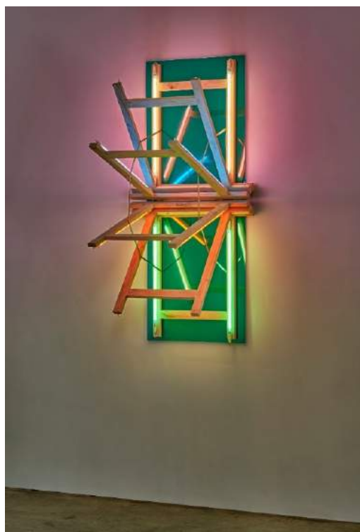
Trestle Dazzle Wall by Rem Atelier.