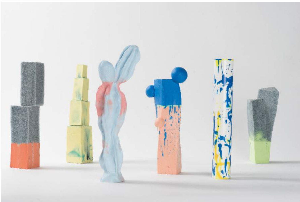
Oedipus by Boris de Beijer.

Following its debut in 2017, Dutch Stuff returns to London Design Fair at the Old Truman Brewery in East London this September. Whereas last year's show was all about making a statement – exhibiting the work of more than 60 Dutch collectives, studios and independent designers – this year's offering is a more refined affair. By scaling the exhibitors back, the designs will be afforded space to breathe, and visitors will have more opportunity to explore the individual designers, products and ideas that are driving contemporary Dutch design thinking forward.