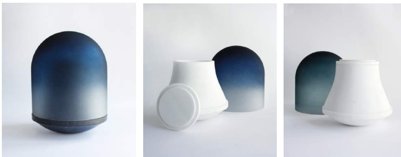
Domes by Maria Tyakina Studio.