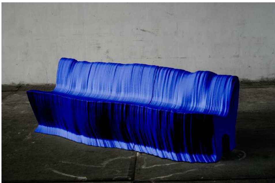
Cutting Edge by Martijn Rigters.

Having first discovered his flair for experimental product design at the Royal Academy of Art in the Netherlands, later honing it the Royal College of Art in the UK, Dutch designer Martijn Rigters is currently based between London and Vienna. The designer's sofa range, Cutting Edge, is the result of his experimentation with hot-wire cutting. Sparked from the idea of movement as a liquid form, a large-scale cutting machine was built to capture the movements of the maker and directly translate them into a permanent shape. Elsewhere, The Colour of Hair (a collaboration with his fellow RCA alumnus Fabio Hendry) carbonises the keratin in human hair into hardened aluminium to create etching-like surface prints.