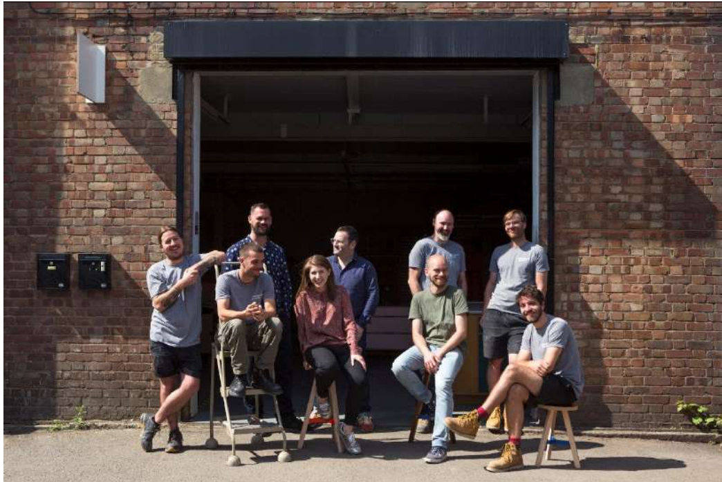
Team Uncommon Projects outside it's production facility in Leyton, East London.