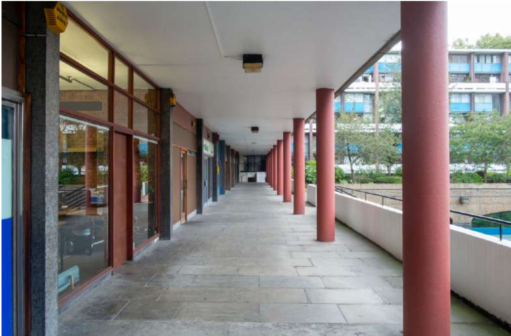
The distinctive Golden Lane Estate, by architects Chamberlin, Powell and Bon, soon to be Uncommon Projects new home.