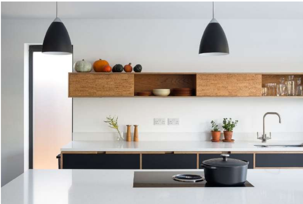
Components are cut by CNC to guarantee precision and minimise waste. Maidenhead by Uncommon Projects.