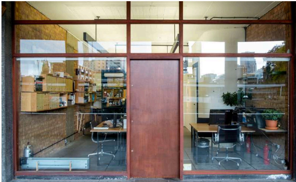
The Golden Lane Estate's distinctive joinery provides light at the front and rear. Uncommon Projects' design will provide views straight through from Goswell Road to the interior of the Chamberlin, Powell and Bon-designed estate.