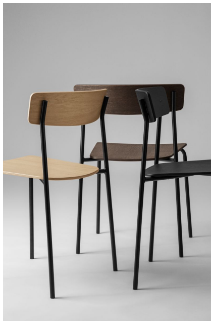
The Cross furniture family is a truly sustainable collection, awarded the EU Ecolabel and made from Forest Stewardship Council-sourced wood.