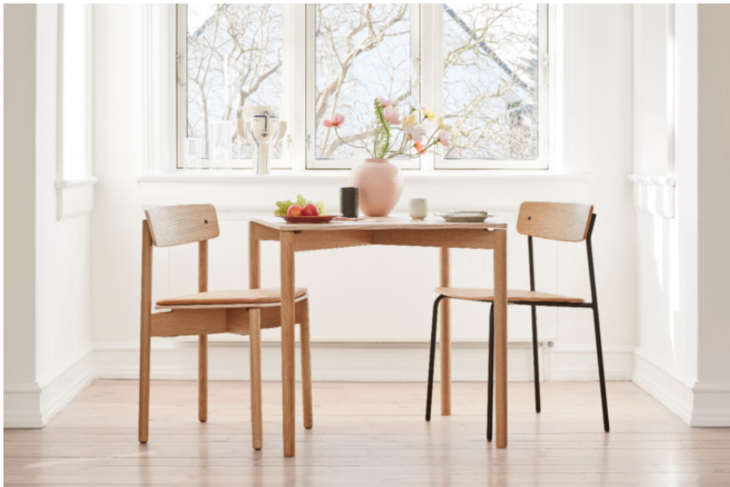
From left: the bestselling 2019 Cross Chair with the new Cross Table and Cross Chair Tube – Pearson Lloyd's eagerly awaited additions to TAKT's Cross family.

In spring 2019, Pearson Lloyd played an instrumental role in the launch of Danish design disruptor TAKT. The new Copenhagen-based start-up set out to reinvent the furniture industry, to deliver high-quality design with an uncompromising approach to sustainability at radically fair prices – selling directly to customers around the world. Pearson Lloyd's Cross Chair – an easy-to-assemble flatpack take on the archetypal timber side chair – was the company's first product, and remains its most successful to date.