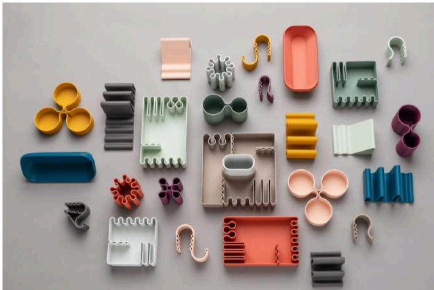
Designed for Bene and 3D-printed by Batch.Works, the B-Friends collection of workspace accessories demonstrated the commercial viability of circular production approaches.

In products such as the 3D-printed office accessories collection BFriends and the flat-packed Cross Chair, which launched the Danish eco furniture brand TAKT, visitors can see how Pearson Lloyd has adopted sustainable materials and innovative manufacturing processes in the face of climate emergency.