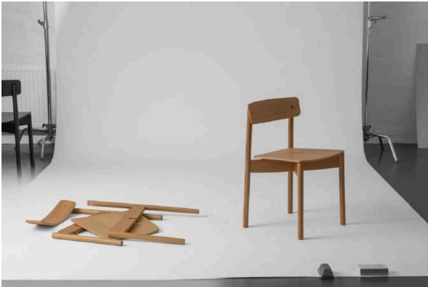
Built in 60 seconds: the flatpack, solid-wood Cross Chair by Pearson Lloyd launched trailblazing Danish eco-design brand TAKT in 2019.

Working strategically with brands, businesses, institutions and public bodies, Pearson Lloyd has always developed systems and products that provide genuine, life-enhancing benefits to their users, but the recent decade has seen the rise of a new stakeholder in every project: the planet itself.