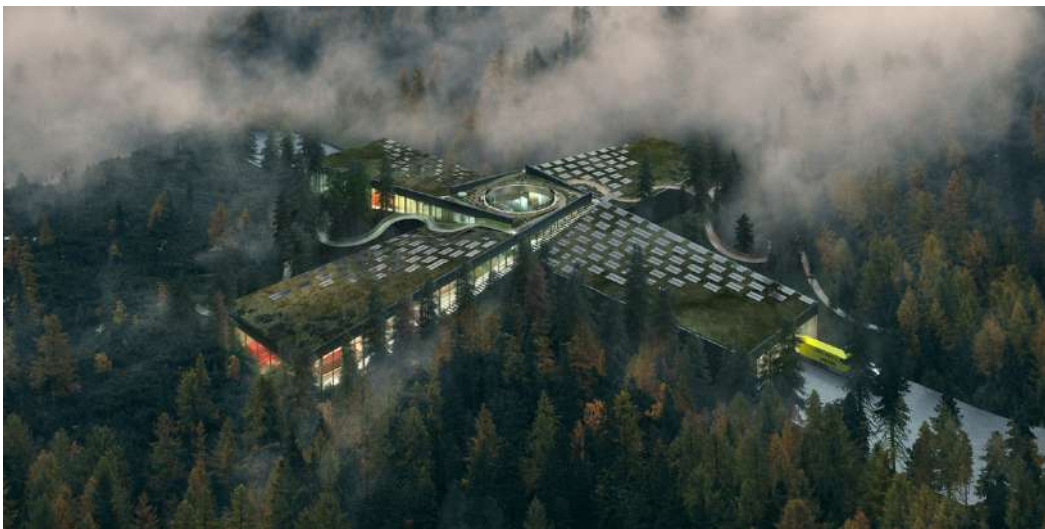
Image of The Plus

One corner of the installation will be dedicated to Vestre's new facility in Magnor, Norway: The Plus – set to be the world's most environmentally friendly furniture factory, generating 55% less greenhouse gas emissions than a conventional manufacturing plant. One of the principal aims of the project is to attract visitors, who will have the opportunity to enjoy a 300-acre public park, as well as watch Vestre furniture taking shape via an accessible rooftop viewing platform.