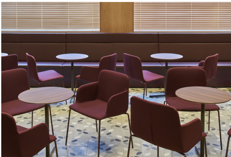
The Brianza chairs echo the scattered leaf pattern of the conference room floor. Both designed by Claesson Koivisto Rune.