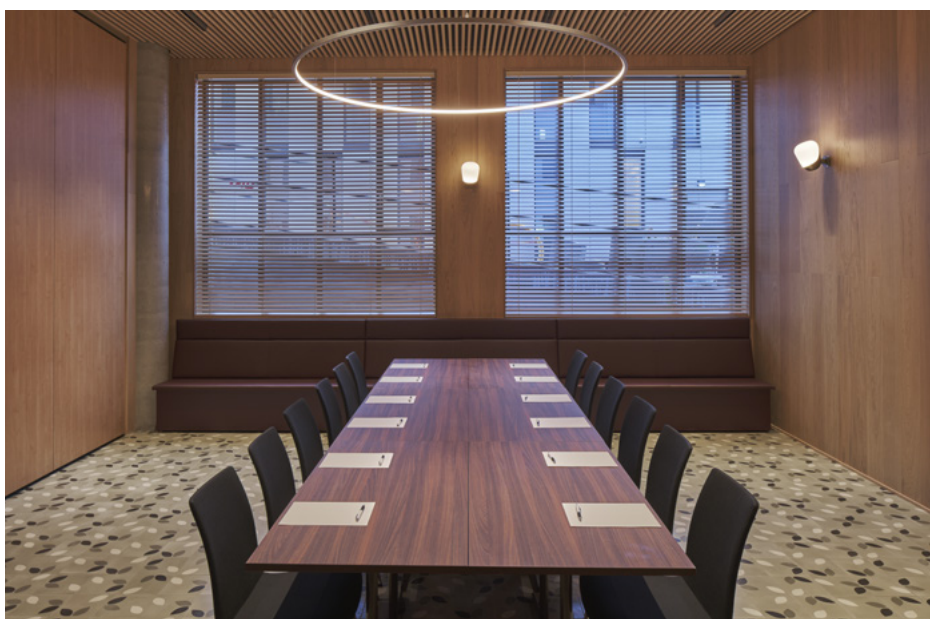
Hardwood ceiling and walls adds dignity to a conference room. Sconce lights by Arne Jacobsen.